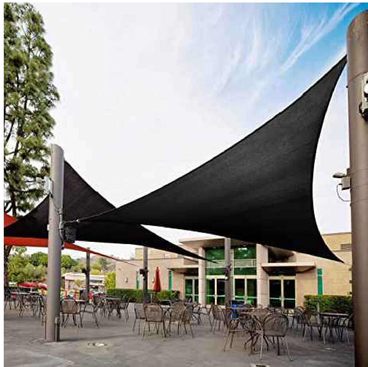
Typical Sun Shade